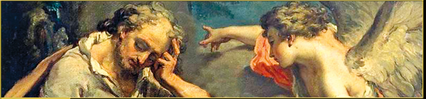
© Diocesan / Joseph's Dream (1790) - Gaetano Gandolfi

...all flesh shall see the salvation of God.